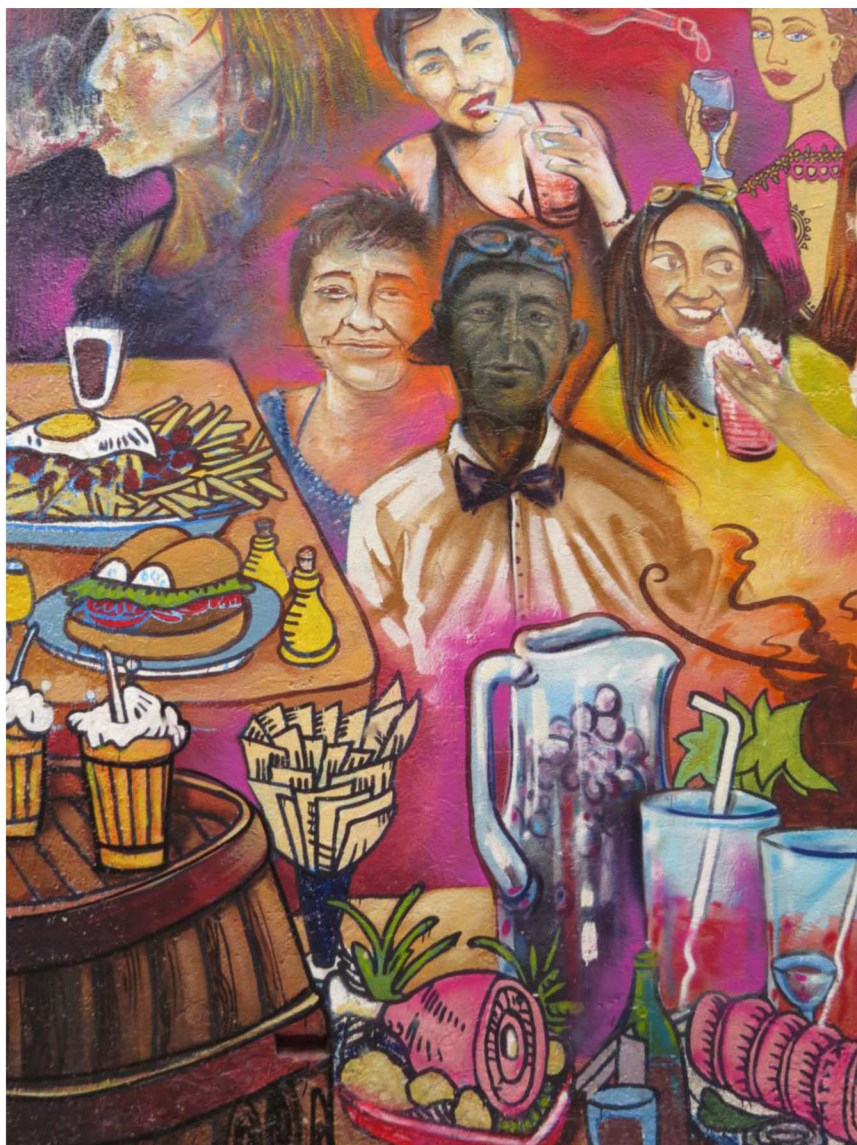
La Piojera, Santiago de Chile